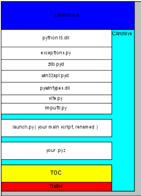
Fig. 3: Structure of the Self Extracting Executable